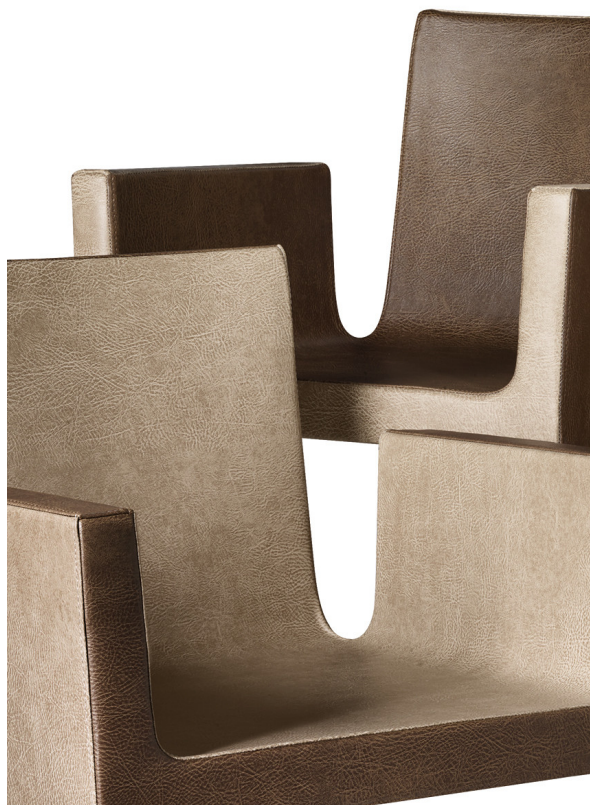
IN PHOTO: COLOUR A: VINTAGE ASH G4 / B: VINTAGE BROWN F5

Le immagini sono fornite al solo scopo illustrativo e non costituiscono elemento contrattuale